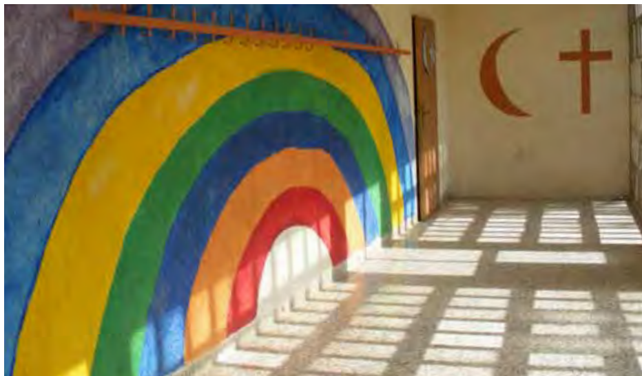
A rainbow shines over the corridor in front of the religious study room at the Theodor-Schneller school.