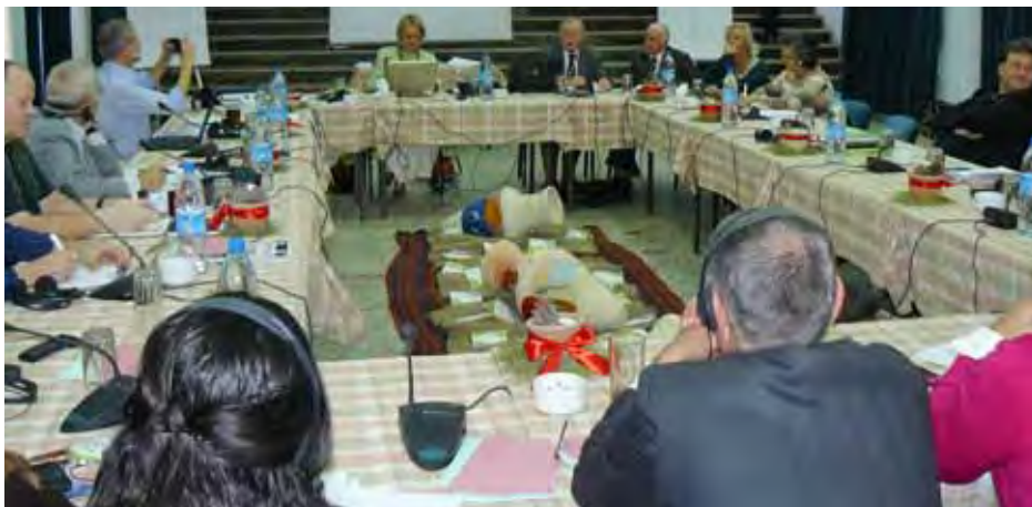
For five days, experts from various disciplines discussed the conditions for successful peace education in Amman.

Amman (EVS). At the end of last year, the Theodor Schneller School extended invitations to attend an international peace education symposium. From 30th November to 4th December 2010, numerous experts from Jordan, Lebanon, Germany and Switzerland met in Amman to discuss the challenges of peace education in the Middle East. Under the title "Education on global action and non-violent communication – Conflict resolution and conflict transformation in the Middle East", theologians, peace educators, teachers, human scientists, social workers and specialists from the development service worked on topics such as interreligious dialogue, violence prevention at schools and peace education. Extracts from contributions of participants who delivered papers were compiled into a trilingual publication