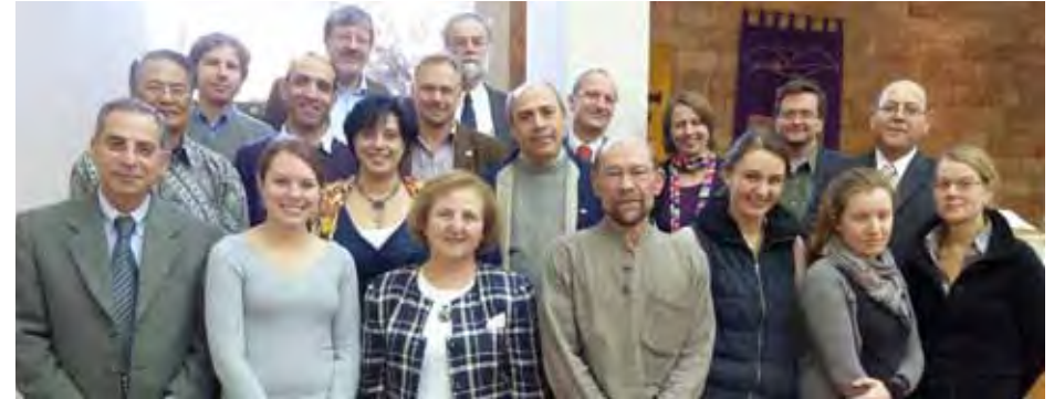
Lecturers from the EMS, members of the SiMO advisory board, former and current SiMO students and an international team from the EMS attended the consultation.