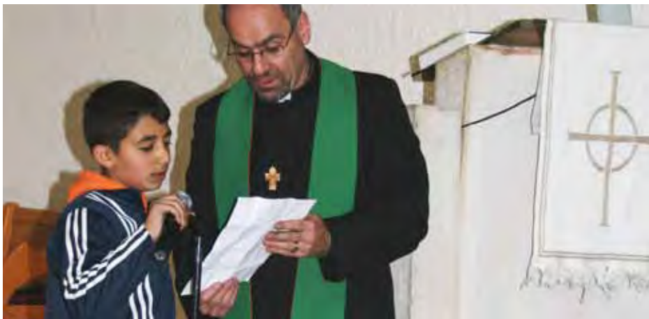
Children often help to organise worship service at the Schneller Schools.