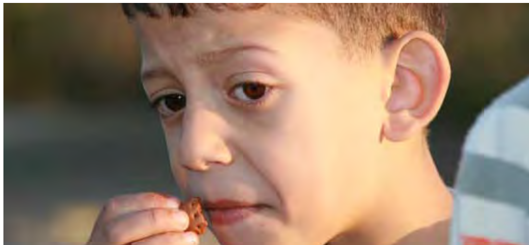
A boy at the Theodor Schneller School in Amman