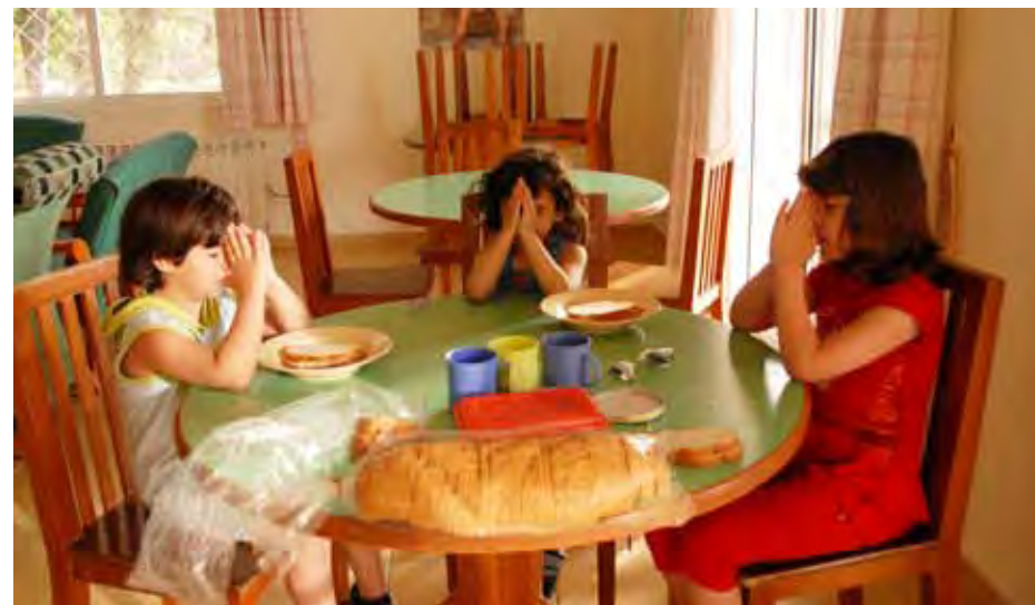
Saying grace at table together at the Johann Ludwig Schneller School: The words are chosen so that everyone can say them.

The combination of these basic insights results in a comprehensive learning task. This is because Only when the younger