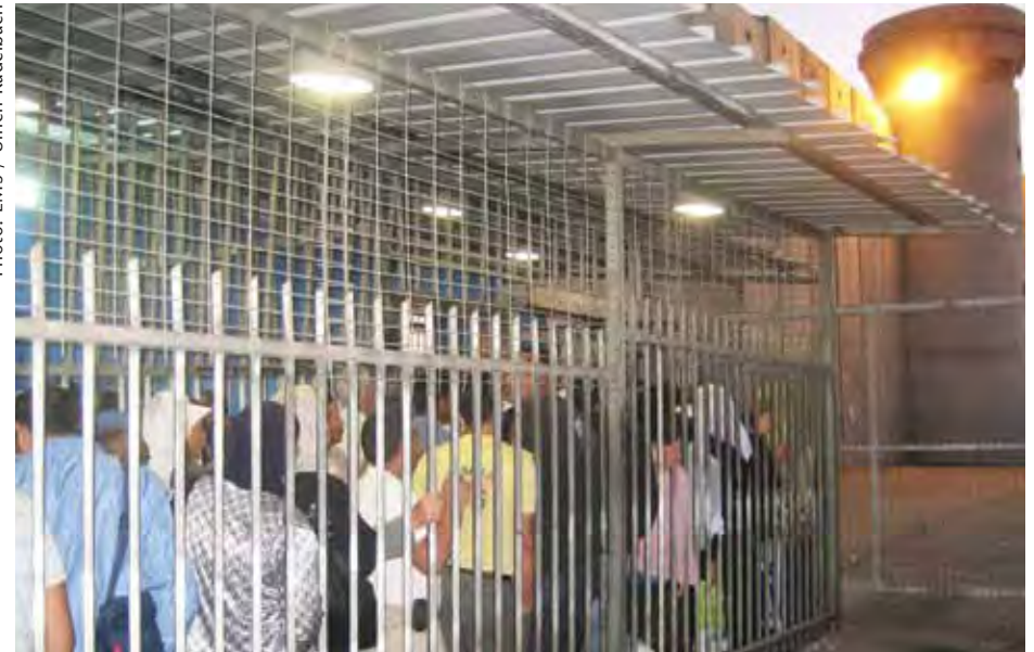
People are waiting densely packed to finally go through the revolving gate.

fixed screws between which each person must place his fingers in precisely the right position. All the data are compiled on the computer monitor. The colour of the control strip gives the soldiers the signal whether it is yes or no. The woman soldier in the thick glass cabin from which commands are only given by loudspeaker sits deep in her chair. A curt wave of the hand is the only generous sign that the person may pass.